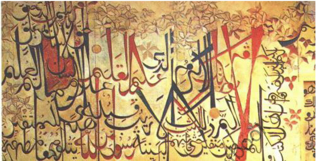
Figure 7.6 Shakir Ali, Quranic Verses, Calligraphic Painting.