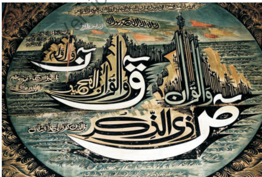
Figure 7.1 Sadequain, Quranic Verses Calligraphy.

Apart from being a prominent painter Sadequain was also among the ones who introduced the painterly calligraphy for the first time in Pakistani art scene. The other person from the same category is Shakir Ali. He belonged to the family of calligraphers. His calligraphic paintings are composed of the same elements as those used in his paintings. The Arabic and Urdu letters take the shape of pointed blades and spikes. The calligraphy is linked with the background which is painted with relevance to the illustrated verse. The script has been written in black or white colour, with the contrasting background against which the calligraphy becomes prominent.