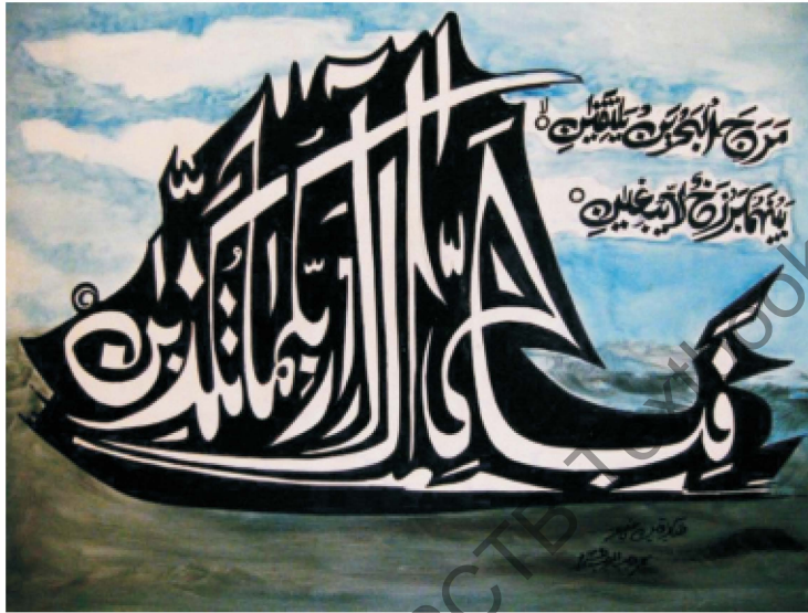
Figure 7.2 Sadquain, Quranic Verses of Surah Rahman, Calligraphy.

He has illustrated Surah Rahman, Surah Yaseen and the ninety nine names of Allah. Surah Rahman has been written three times on different surfaces i.e. canvas, cellophane and marble slabs, each time with different design. Surah Yaseen had been on display in the Lahore Museum on the wooden panels 260 feet long, while the names of Allah are displayed in the Indian Institute of Islamic Studies at Delhi, on a round wall of 2880 feet square. 33