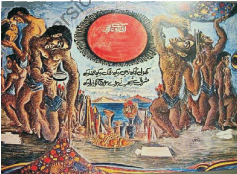
Figure 7.3 Sadquain, Illustration of the Poetry of Allama Iqbal.

Moreover, he has also illustrated the poetry of Mirza Ghalib, Allama Iqbal and Faiz Ahmad Faiz. With these illustrations the relevant verses were calligraphed on the same or the adjacent panel.