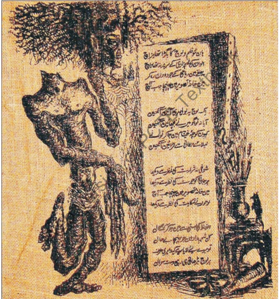
Figure 7.4 Sadquain, An Illustration from Sadequain's Rubiyat.

Apart from being a painter and calligrapher he was also a poet. He said, "Painting is moving towards poetry, poetry is moving towards calligraphy, and calligraphy is moving towards painting." 34 He wrote rubaiyat and illustrated them in pictorial form along with the Urdu text calligraphed in a panel within the same composition.