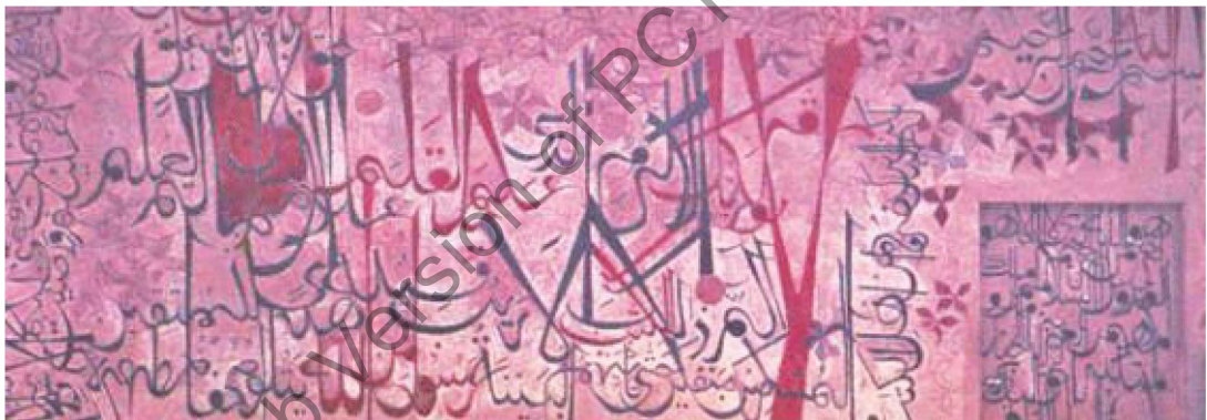
Figure 7.7 Shakir Ali, Quranic Verses, Calligraphic Painting.