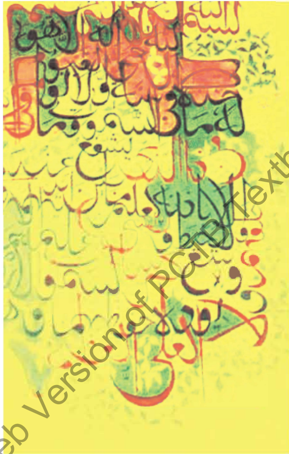
Figure 7.5 Shakir Ali, Ayat-ul-Kursi, Calligraphic Painting.

Along with Sadequain, Shakir Ali introduced the medium of painterly calligraphy. Being an abstract painter, he visualized the Arabic script as the abstract shapes of “arcs and loops, ovals and circles, vertical and horizontal lines.” 35