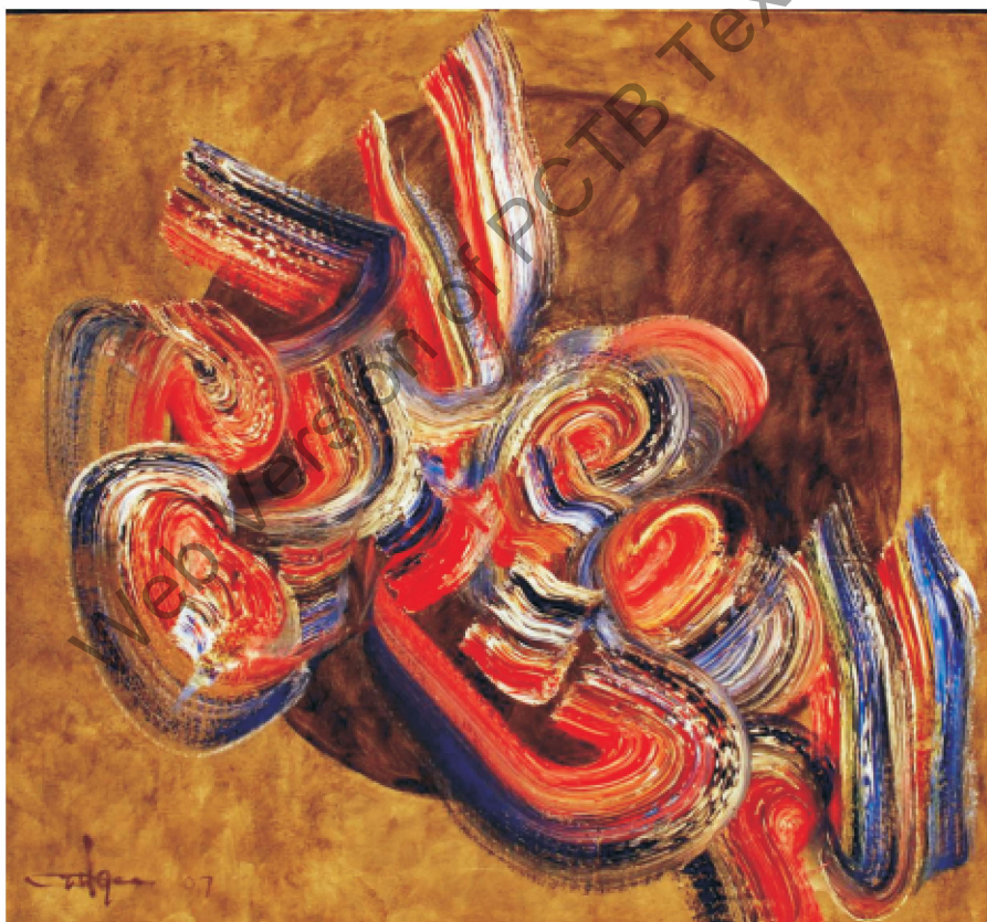
Figure 7.11 Gulgee Calligraphic Painting with Bold Strokes.

The style of action painting that he practiced also inspired his calligraphic paintings with the bold and spontaneous strokes with a thickly loaded brush. This is the style that raised him to the fame un-paralleled in the art of calligraphy. The brush was loaded with many different colours to create cursive forms with force and freedom. Strokes were not applied in straight line, instead there were arcs covering most of the canvas surface.